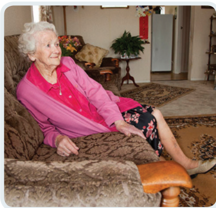
Figure 4. Pivot body around to sit on the chair.